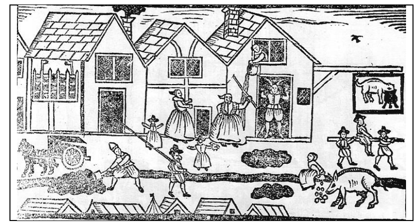
[A Tudor street scene]