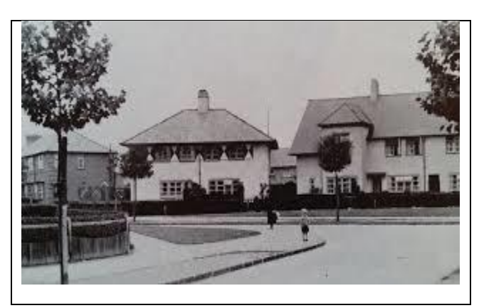
[A housing development in the 1930s]

Use Sources A, B and C above to identify one similarity and one difference in living conditions over time.